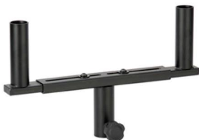
"T" support for 2 units IT 112 PA .