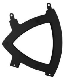
Flight hardware for IT 112 PA.