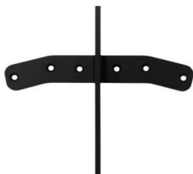
Flight bumper to work in cluster mode.